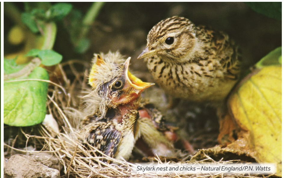
Skylark nest and chicks