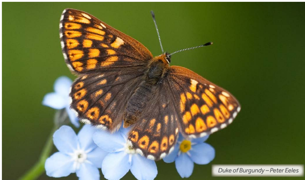
Duke of Burgundy – Peter Eeles

Increase tree canopy and woodland cover (combined) by 3% of total land area in Protected Landscapes by 2050 (from 2022 baseline).