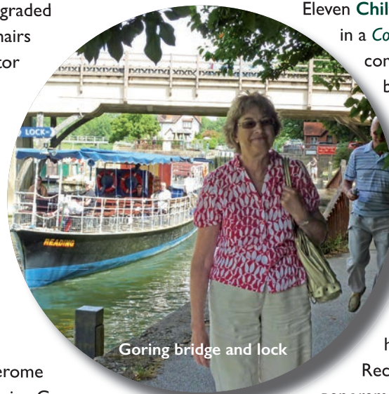
Goring bridge and lock

Miles of towpaths and level or gently graded footpaths, many accessible to wheelchairs and mobility scooters, enable the visitor to explore the Thames and enjoy magnificent views of the unspoilt scenery on its Oxfordshire and Berkshire banks. Linking these historic counties is the picturesque Goring bridge . Its adjacent river lock and nearby open spaces are ideally accessible spots for the perfect summer picnic. Kenneth Grahame and Jerome K Jerome found inspiration in the Goring Gap for their classic tales, The Wind in the Willows and Three Men in a Boat . Oscar Wilde, who lived briefly in Goring, was inspired to give local place names to six of his characters in An Ideal Husband . Today's visitors find inspiration in the scenery, the warm welcome and the unrivalled hospitality. For what else to see and do and where to stay in the Goring Gap go to: ❖ www.withymead.co.uk ❖ www.visitgoringandstreatley.co.uk ❖ www.bbwt.org.uk/reserves/Hartslock ❖ www.visitthames.co.uk/about-the-river/river-thames-locks/goring-lock