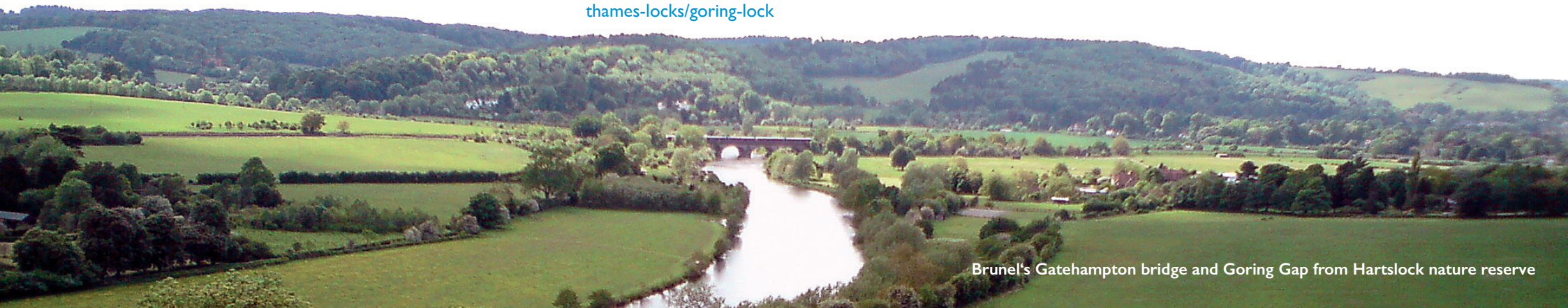
Brunel's Gatehampton bridge and Goring Gap from Hartslock nature reserve

Long distance rambling with mobility scooters can be enjoyed along the wide track of the Ridgeway heading west from Streatley along Rectory Road. From here there are panoramic views of the Thames valley and the Chilterns beyond. The Thames Path and Ridgeway are being improved constantly to make them more accessible. The latest accessibility details can be found online at: ❖ www.nationaltrail.co.uk/ridgeway and ❖ www.nationaltrail.co.uk/thamespath ❖ See also: ❖ www.chilternsaonb.org ❖ the interactive map at: www.northwessexdowns.org.uk and ❖ the Oxfordshire countryside access map at: www.oxfordshire.gov.uk/countrysideaccessmap