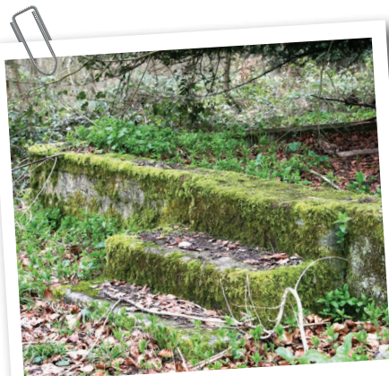
Remains of Nissen huts from WWII

See if you can spot the zigzag trenches also built by the army in WWII.