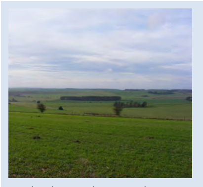
The downs above Lambourn.