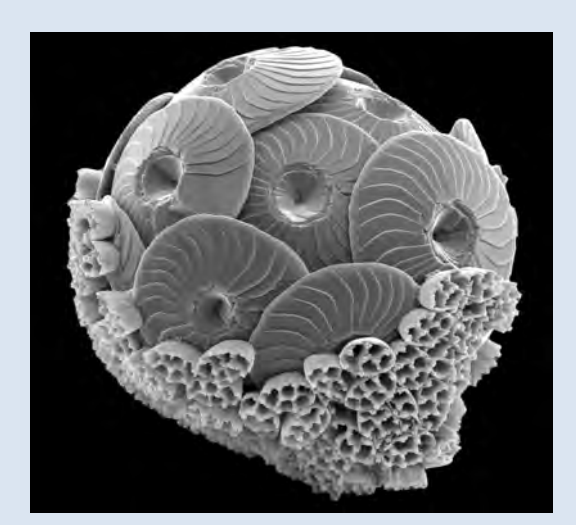
The chalk that underlies the soft turf of the Downs is made up of these coccolithophores. About half a million of them would fit on a pin head!