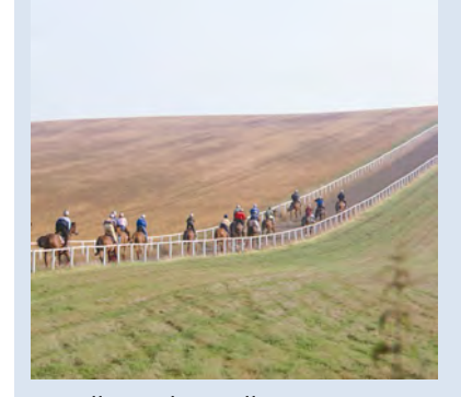
All weather gallops are now common across the North Wessex Downs.

Early race meetings were very local and at Wantage in the 1750s it was decreed that 'no booths or sheds to be erected, or any liquor to be sold by any person on the Downs, but by the inhabitants of Wantage and Lambourn'. Lord Craven donated much of the prize money.